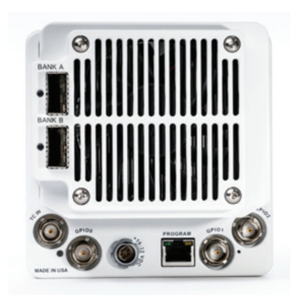
Phantom S991 Connectors