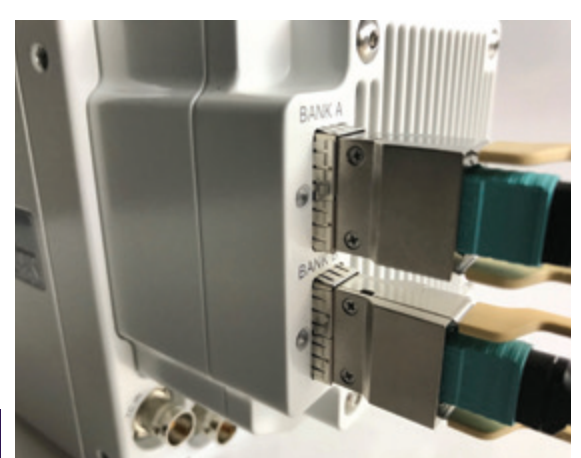
Phantom S991 with cables