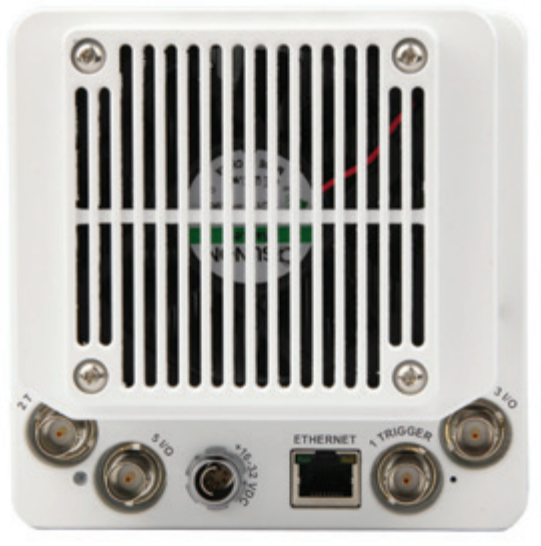
VEO S-model (Top), L-model (Bottom)