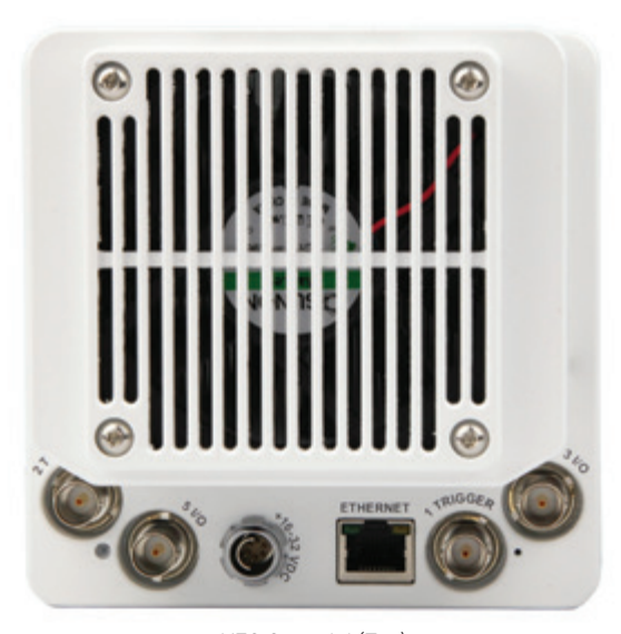
VEO S-model (Top), L-model (Bottom)