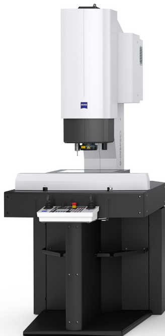
ZEISS O-INSPECT 3/2/2