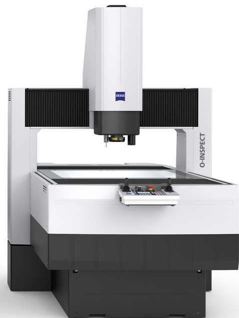
ZEISS O-INSPECT 8/6/3

Carl Zeiss IQS Deutschland GmbH Carl-Zeiss-Straße 22 73447 Oberkochen