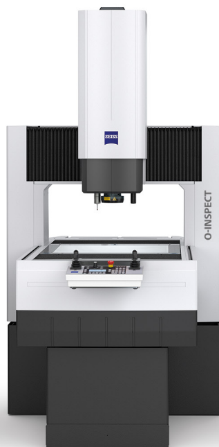
ZEISS O-INSPECT 5/4/3