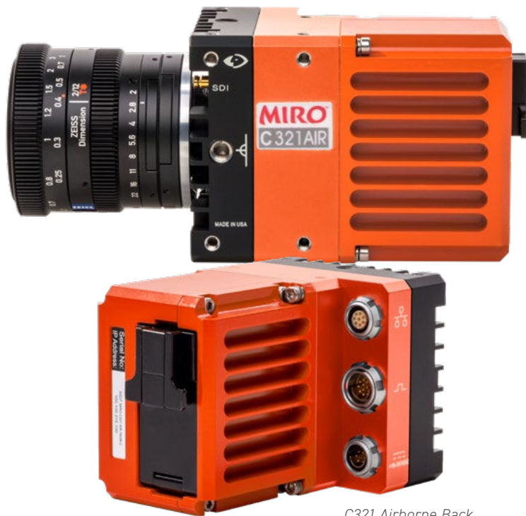
C321 Airborne Back