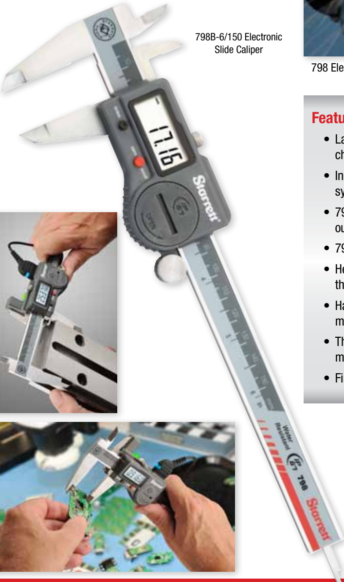
798B-6/150 Electronic Slide Caliper