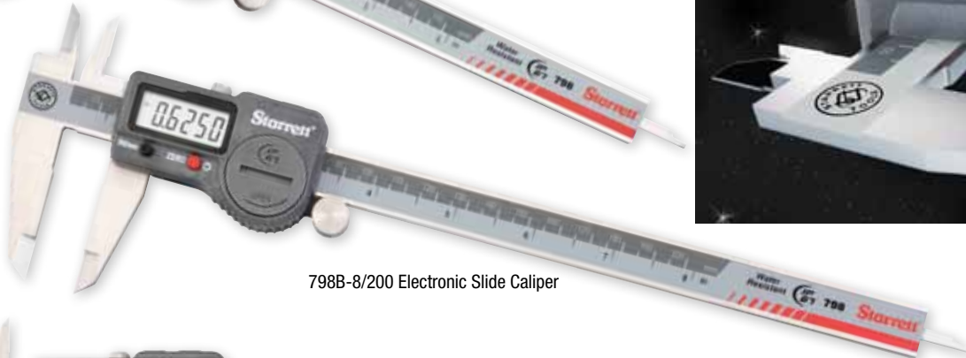
798B-8/200 Electronic Slide Caliper