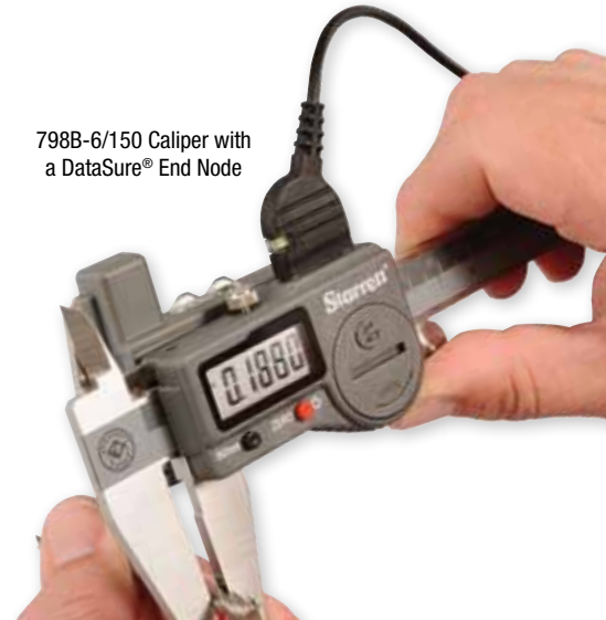
798B-6/150 Caliper with a DataSure® End Node