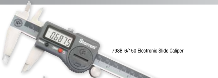
798B-6/150 Electronic Slide Caliper