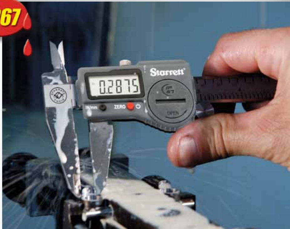
798 Electronic Slide Calipers have IP67 Protection against dust, dirt, water and coolant

Available with measuring capacities to 12" (300mm), these full-featured electronic slide calipers are built with customary Starrett quality and workmanship.