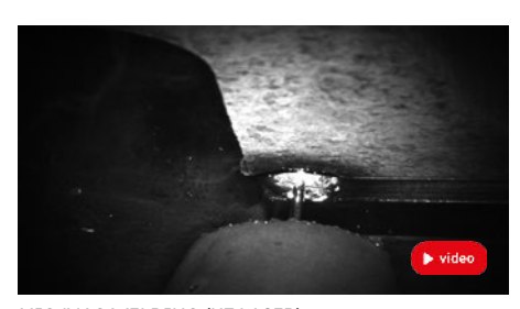
MIG/MAG WELDING (HT LASER)